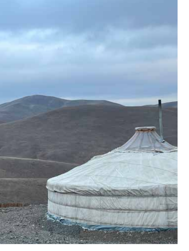
A new church in Mongolia meets in a yurt. Story on page 7.